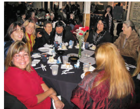
Everyone had a great time at the Holiday Dance.

*state mandated closure day for Work Activity, Adult Day, and South Bay Clubhouse Programs