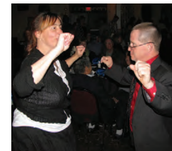
Cutting the rug at the Holiday Dance.

We just completed our CARF accreditation survey on January 24-26, 2011. Two CARF surveyors visited