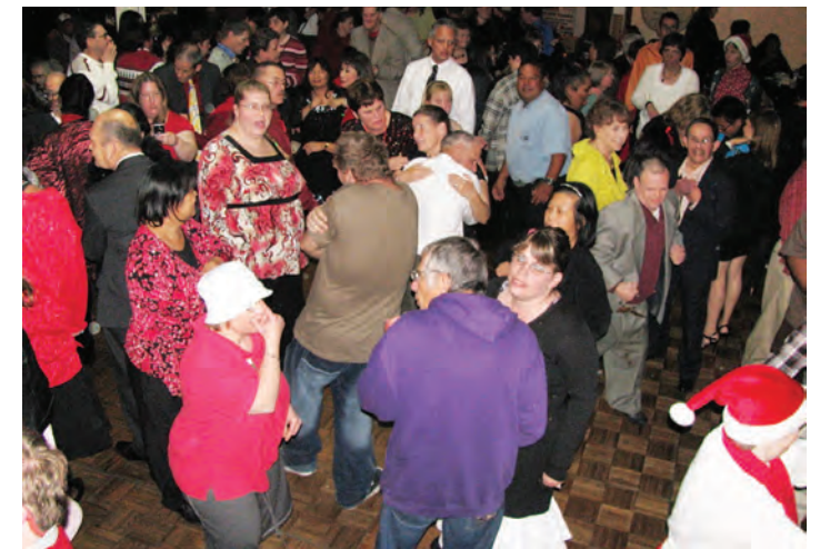
Over 300 guests enjoyed the 2010 Holiday Dance.

T hanks to everyone who called, visited, and or wrote to their elected officials to help preserve and protect the Lanterman Act and people with developmental disabilities. Your support for Californians with developmental disabilities and Elwyn California is very much appreciated. I only hope that the legislators in Sacramento think carefully about the consequences their actions will have on the day to day lives of some of our most vulnerable citizens. Let's hope they look for savings in government, bureaucracy, inefficiencies, redundancies, and waste before cutting direct services that affect people's lives. That is the key message: "Keep the cuts as far away from direct services as possible" . Please keep communicating this to legislators.